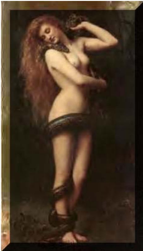
“Lilith” by John Collier

"But in the meantime, she found to her dismay that her hopes could not be fulfilled because during that time a dragon had built its nest at the foot of the tree, the Zu-bird was raising its young in the crown, and the demon Lilith had built her house in the middle. But Gilgamesh, who had heard of Inanna's plight, came to her rescue. He took his heavy shield, killed the dragon with his heavy bronze axe, which weighed seven talents and seven minas. Then the Zu-bird flew into the mountains with its young, while Lilith, petrified with fear, tore down her house and fled into the wilderness."