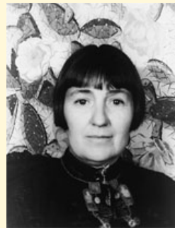
Mabel Dodge Luhan in 1934.

Hoping to transform Anglo American culture from its militaristic, individualistic, and materialistic values, she sought to create a utopian community that would attract the nation's (and the world's) greatest writers, artists, and social reformers. Over the course of the 40 years she lived there, she hosted Marsden Hartley, Georgia O'Keeffe, D. H. Lawrence, Ansel Adams, and many other movers and shakers.