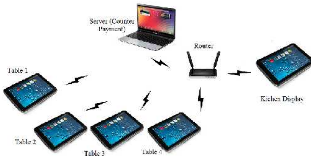
Fig. 1 System Architecture

The system architecture of Touch and Order in restaurants is shown in figure 1. The architecture attempts at a full coverage of the three main modules of restaurant: the Serving area, the Kitchen, and the Admin cashier counter [5]. The main components of this system are: