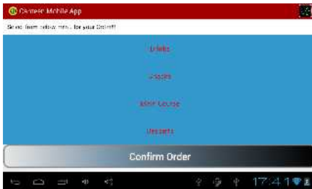
Fig. 3 Screenshot of Different Category

It is a Digital Android based technique that gives us best result with real time feedback to customer, Attractive User interface, improve performance, easy to use and gives customer satisfaction.