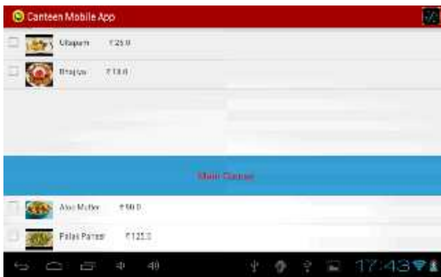
Fig. 4 Screenshot of Submenus

In this result analysis Fig. 3 shows, When application is open it shows different category of menu that display on customer tablet.