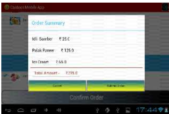
Fig. 5 Order Summary

Category of menu expandable in different submenus. Submenus contains clickable selected box image of item with name of item and price of item.