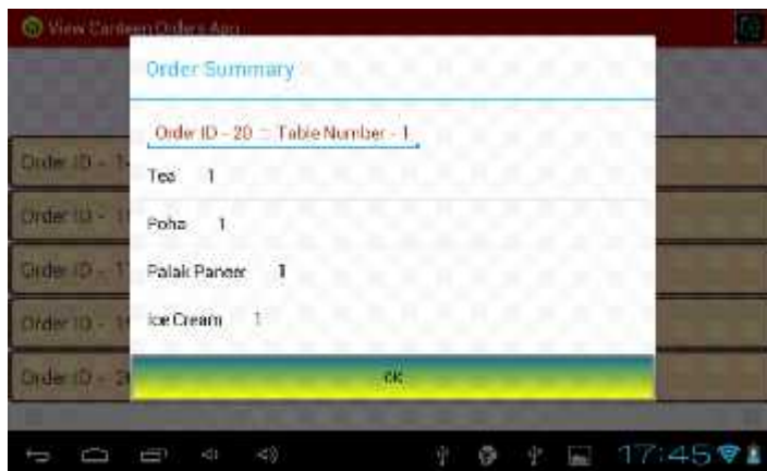
Fig. 7 Order Summary in Details

Fig. 6 shows selected order summary display on kitchen tablet or android device. It summarized as Order Id with table number.