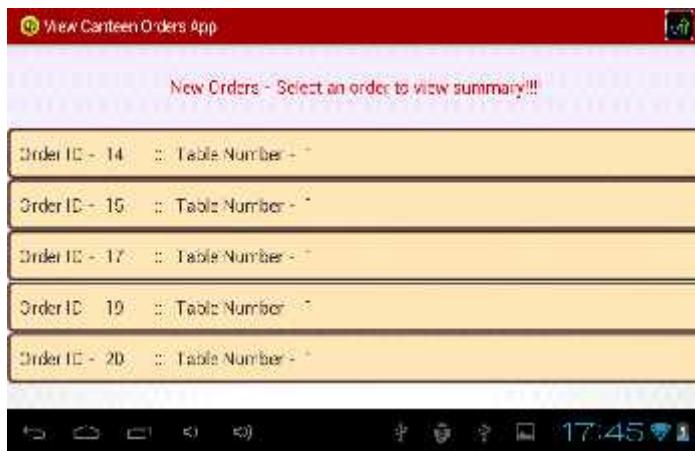
Fig. 6 Selected Order Summary

Customer have a two options cancel order that order it would be canceled and second option is submit order, that order will proceed to admin cash counter server as well as kitchen display.